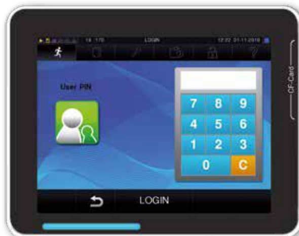
Individual operator PINs