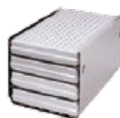
Mount >B< for 4 standard tray cassettes