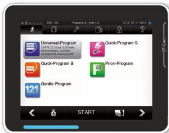
The menu for selecting the sterilization programs

Autoclave operation needs to be simple, error-free and fun. The intuitive operation of the autoclave using an extra-large colour-touch-display enables quick program selection, options settings, individualization of the display colour and much more. This display is unique, providing as it does, the world's largest colour-touch-display to be found in a large-scale production practice autoclave.