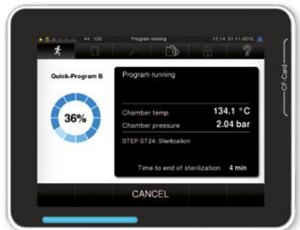
The sterilization run is displayed in a clear and easy-to-read fashion.