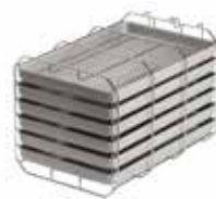
Mount >C< for 6 trays

Autoclaves need not just to be quick, but also economical. Autoclaves of the Premium-Plus-Class can sterilize up to 6 standard trays or 4 MELAstore-Boxes 100 simultaneously. We provide a number of mounts for this purpose. The autoclave scope of delivery includes one mount. The mount >C< is especially versatile as it can be used both for trays as well as MELAstore-Boxes 100 (upon rotating the mount 90°).