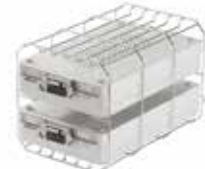
Mount >D< for 2 MELAstore-Boxes 200