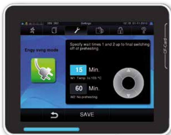
The settings in the energy-saving mode

The contribution of intelligent systems to time saving and environment protection