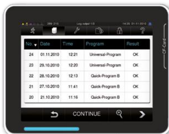
A Menu to select individual or multiple logs