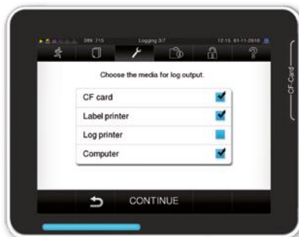
Individual and multiple output media can be selected very easily

Premium-Plus-Class autoclaves represent a modern system catering for the needs of every practice, including documentation via your practice network, the Ethernet system interface and barcode label printing up to log issue on the CF card or the MELAprint 42 log printer.