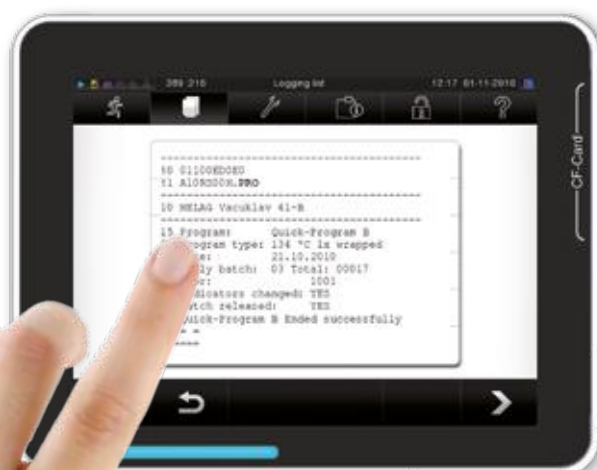
View the log on the display

Many practice workers see documentation as a necessary but unpleasant task. The new operating concept and the large colour-touch-display enable a documentation procedure which saves time and is fun to use.