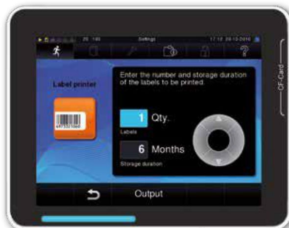
Selecting the number of labels and maximum storage period