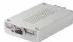
MELAstore-Box 100 and 200