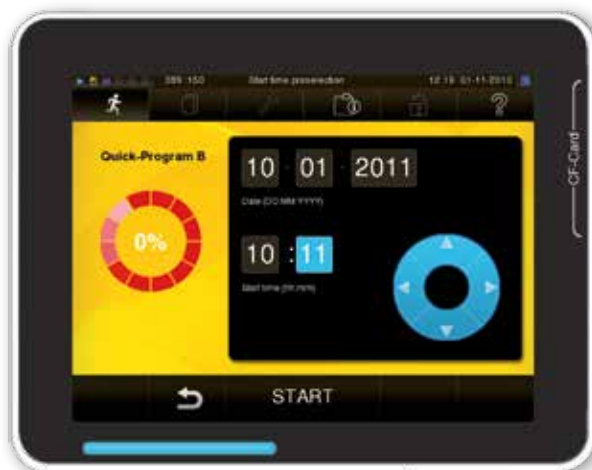
Time pre-selection for automatic autoclave start

As a family-owned company taking a long-term perspective, MELAG has a long record of environmental responsibility and resource-conservation. Our development and production operations always aim to conserve energy. Our Premium-Plus-Class autoclaves are all fitted with an