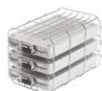
Mount >C< (rotated) for 3 MELAstore-Boxes 100